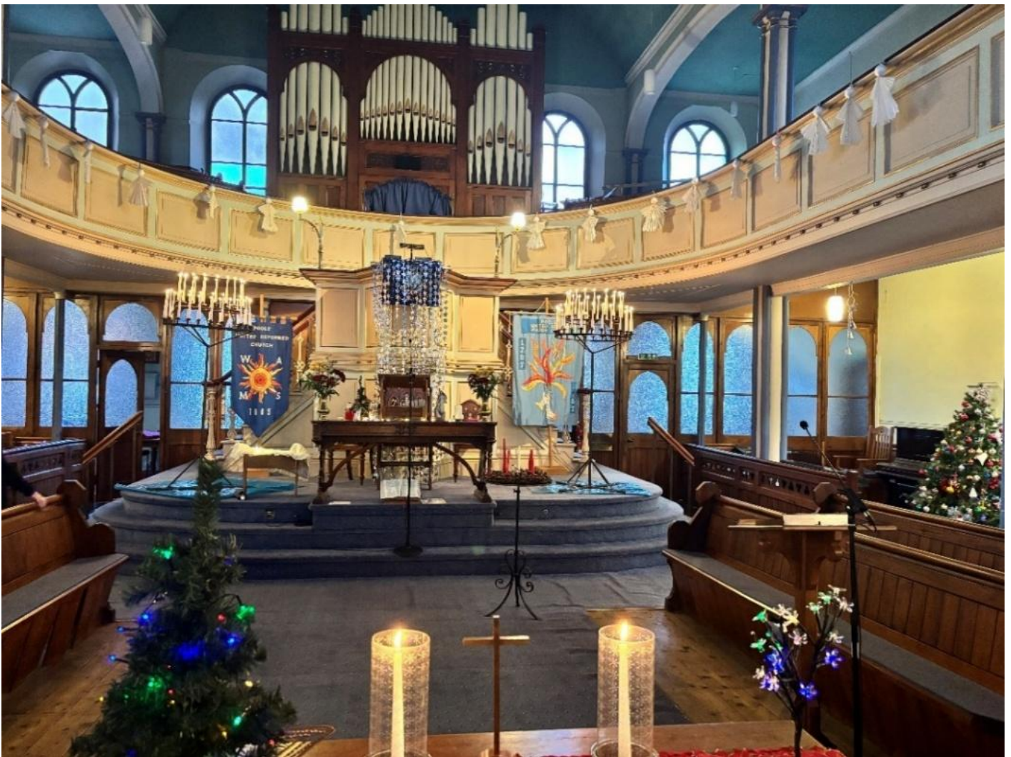
The church ready for the Candlelight Carol service in December

Guided by the Holy Spirit we aim to show the love of God the Father for everyone by sharing the work of his Son, Jesus Christ, among our neighbours in Poole and the wider world.