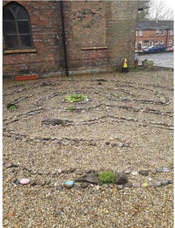
The prayer labyrinth

We have also been enjoying creating and using our prayer labyrinth which was built one Sunday very unexpectedly and with surprising ease. The younger members of the group have loved decorating stones which form the layout of the labyrinth and we have also been busy planting it up with rock plants, primroses and violas so it will eventually be a living labyrinth! God is so faithful and we continue to be surprised by His provision and the ease in which we grow and journey on as a group.